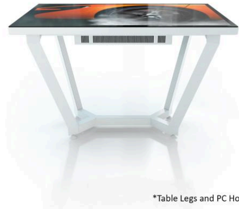
*Table Legs and PC Holder optional