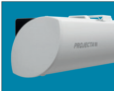
Leaf shaped case design