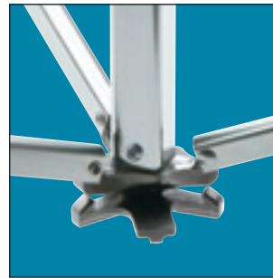
Simple, foot-operated toe-release mechanism